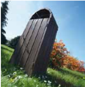
Dome Top Bin