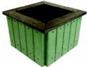
Planter with Rim